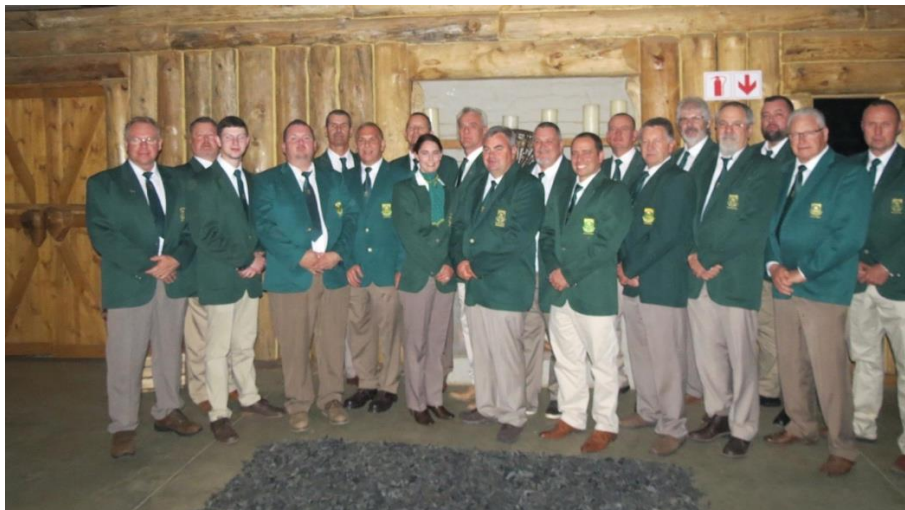
Photo of new and past Protea members

SAPSSF have a tradition to make the National colours evening a special event at every World competition and this year was no exception. National colours and federation colours were handed over to competitors.