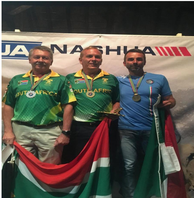
Rim Fire Light Varmint medal winners.