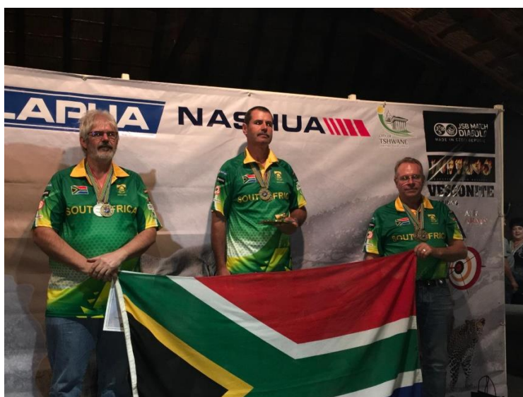
Air Rifle Heavy Varmint -Senior prize giving