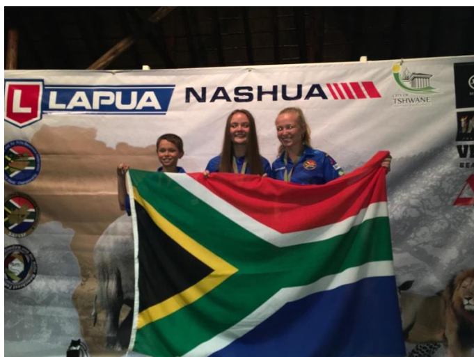
Air Rifle Light Varmint – Junior prize giving